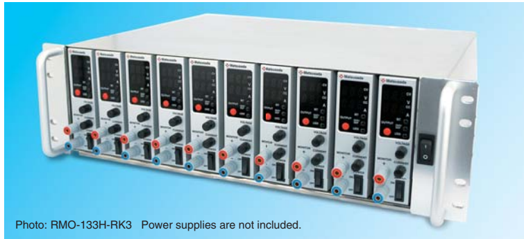
Photo: RMO-133H-RK3 Power supplies are not included.